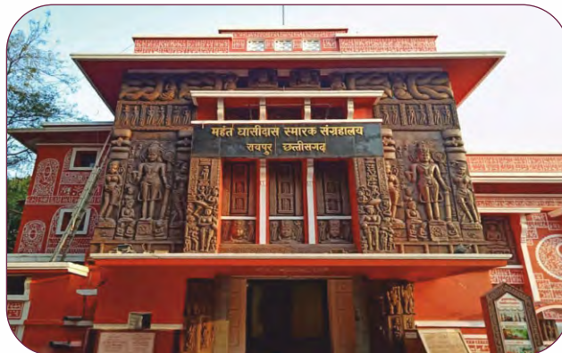
Mahant Ghasidas Museum