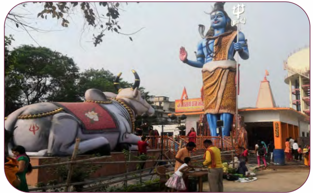
Mahadev Ghat Temple