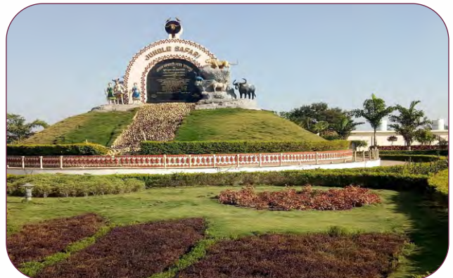
Nandanvan Jungle Safari